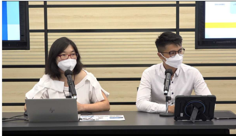
Conducting seminar on slope maintenance and repair

The Department also publishes a number of information leaflets and booklets to raise public awareness of slope safety. These include –