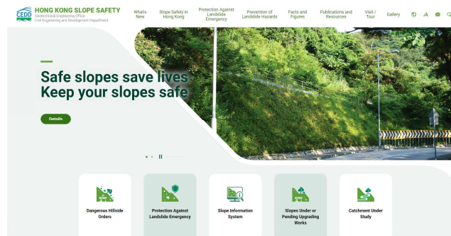
Hong Kong Slope Safety Website

The Department has a computerized Slope Information System (SIS) for storing and maintaining the records of about 60,000 registered man-made slopes and retaining walls in Hong Kong. The SIS is available in the Hong Kong Slope Safety (HKSS) Website ( https://hkss.cedd.gov.hk ),